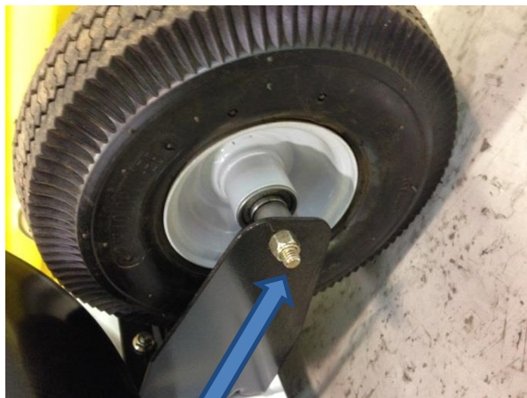
Remove Nut and Bolt