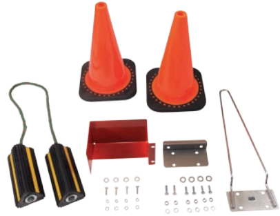
Safety Kit available for all trailer units. P/N 010012