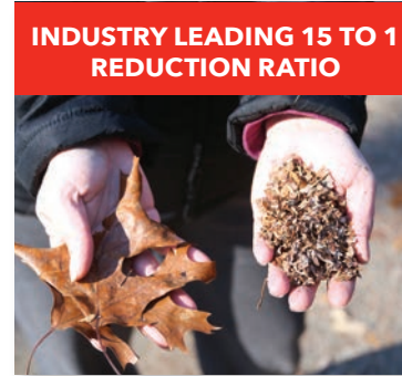
INDUSTRY LEADING 15 TO 1 REDUCTION RATIO

Little Wonder Monster TruckLoaders are all bite, attacking debris with ease. These monstrous machines allow you to fit more in the truck and clear more properties between offloads for higher productivity and more profit.