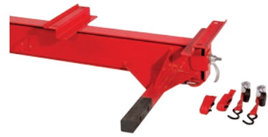
Swing Away Hitch (14HP & 18HP only)