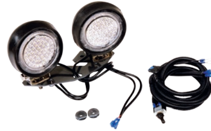
LED Light Kit available for all models. P/N 010032-1